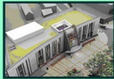
Ashford Gateway Plus