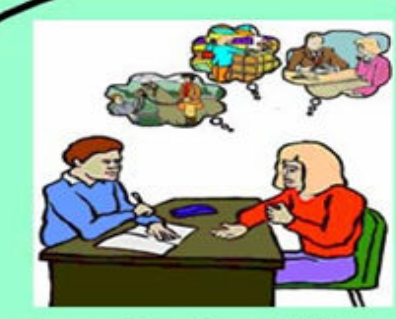
Person Centred Planning